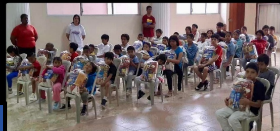
August Food Kit