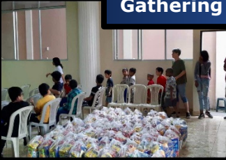
Gathering in the temple