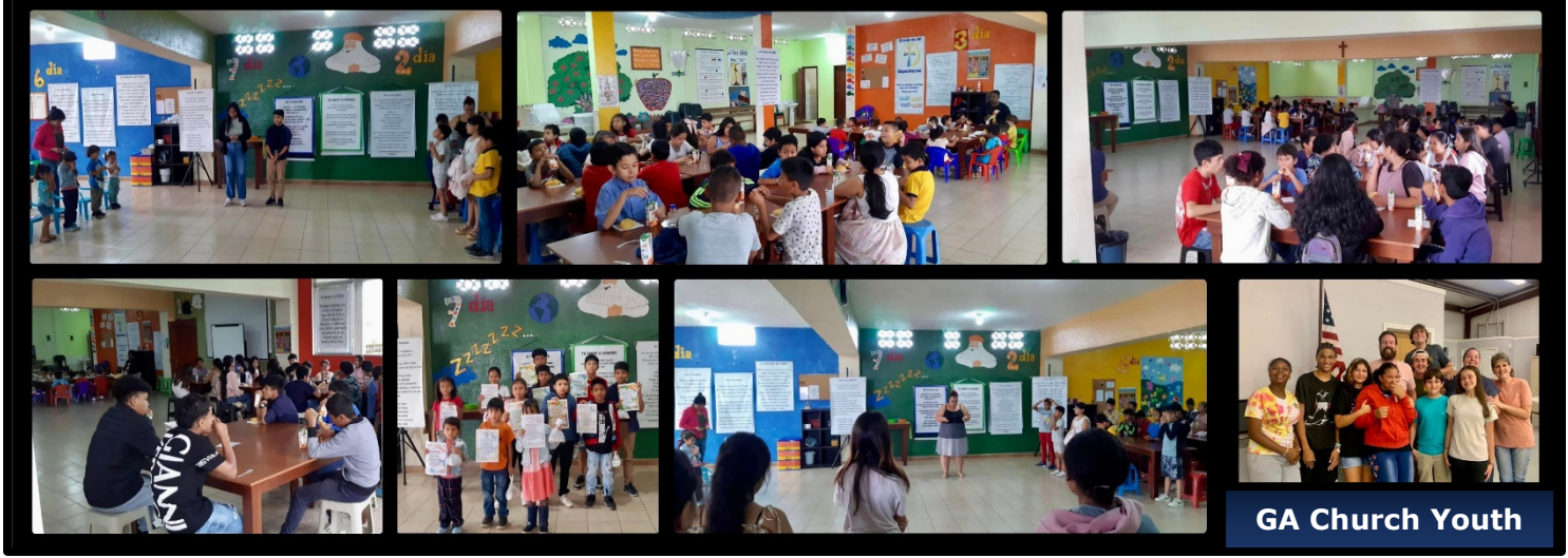
GA Church Youth