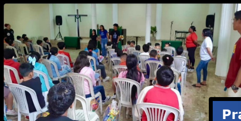
Prayer for 2 moving up in age-groups